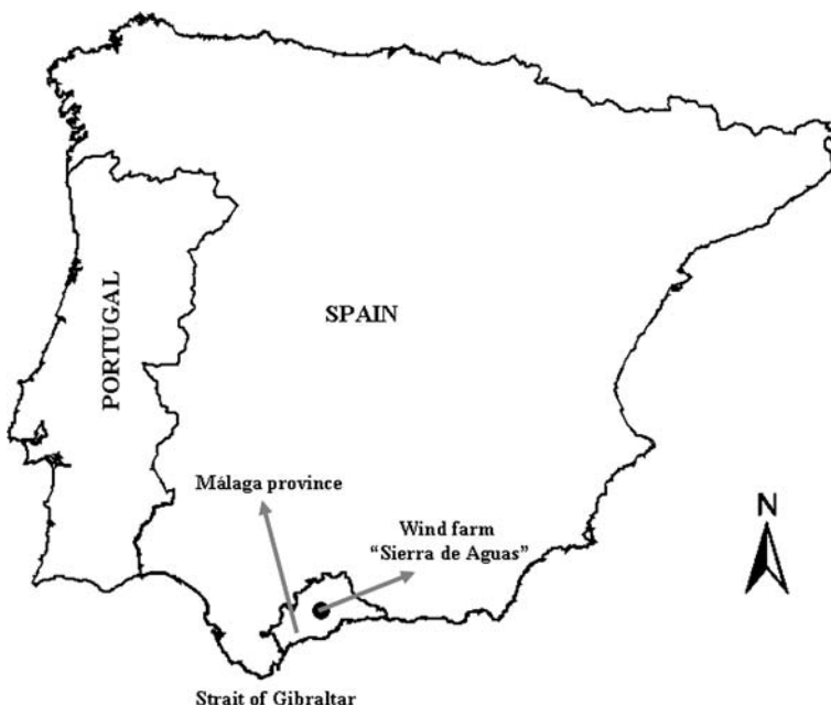
Fig. 1 Location of the study area

Each wind turbine generates 850 KW. Thus, the total power of the wind farm is 13.6 MW. The wind turbines have three blades with variable step. They are made of